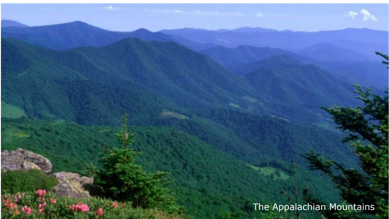
The Appalachian Mountains

The physical geography of New England is diverse for such a small area. Southeastern New England is covered by a narrow coastal plain, while the western and northern regions are dominated by the rolling hills and worn-down peaks of the northern end of the Appalachian Mountains. The Green Mountains are part of the Appalachian Mountains. Vermont, "The Green Mountain State", is named after them. The part of the same range that is in Massachusetts and Connecticut is known as The Berkshires or the Berkshire Hills.